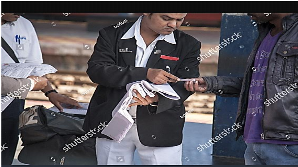
Figure 1: Traditional Railway Ticket Checking System