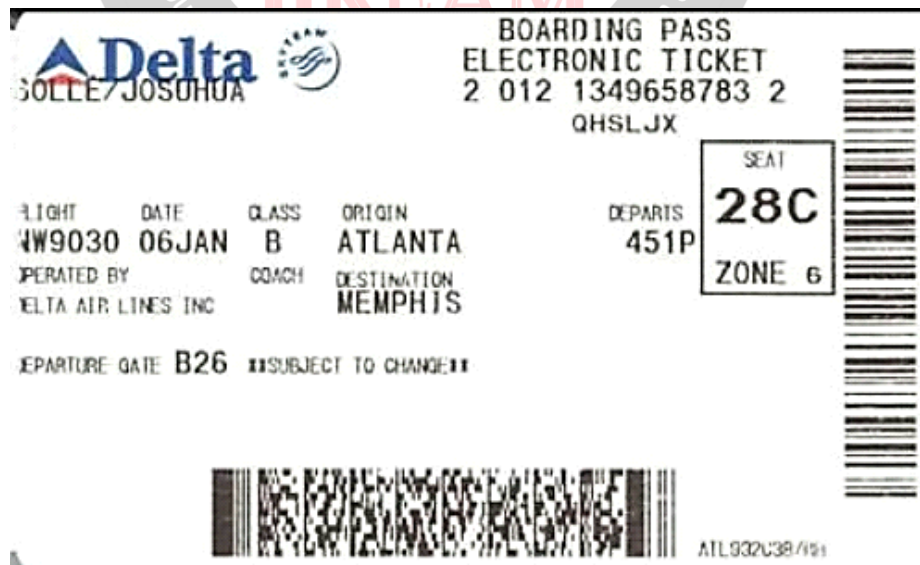
Figure 2: Barcode Based Technique

The passengers will scan their tickets through the barcode scanner which will be there in the respective boogie and accordingly the ticket distribution systems located at various stations will be updated. Suppose, if Ticket number 4 is absent out of 5, then the Microcontroller 1 will send the absent number via sender ZigBee and the receiver ZigBee will receive the absent ticket number 4 to Microcontroller 2 which will send absent number via GSM to station GSM. All the waiting passengers will then get message on their mobile through GSM.