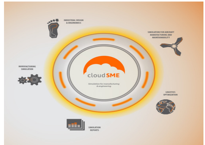
Fig. 1 CloudSME

underlying infrastructure and platform services. These users normally use a front-end application with a graphical user interface (GUI). CloudSME end users will use GUI and front-end applications or a web service employing SaaS [17].