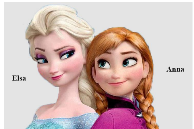
Figure 5.3 Characters from the Movie Frozen

Unlike Elsa, Anna is born without magic, thus lacking any sort of enchanted abilities. She relies solely on fearlessness and optimism to guide her through perilous situations. The love she harbours for her sister is so powerful, that in the song, “For the First Time in Forever”, she is seen dancing and subsequently flinging a bust with ease.