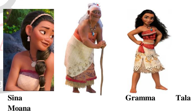
Figure 5.7 Characters from the Movie Moana

Moana's mother always has her back. Playful, sharp and strong-willed, Sina appreciates Moana's longing to be on the water. But much like Tui, her hard-headed husband, Sina wants to protect her daughter from the fabled dangers beyond the reef. Above all, Sina trusts Moana to make the right decisions.