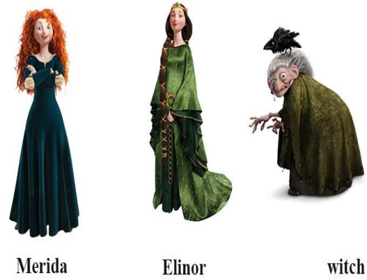
Figure 5.2 Characters from the Movie Brave

The witch has knowledge in magic and uses the magic for her wood carver work. She owns a speaking crow, a moving broom and other abnormal wonders.