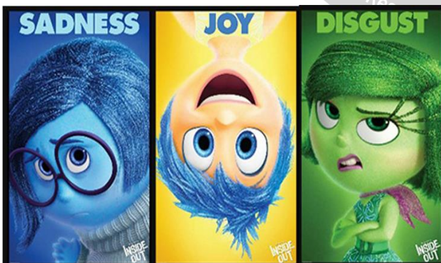
Figure 5.6 Characters from the Movie Inside Out

Disgust is highly opinionated, extremely honest and prevents Riley from getting poisoned - both physically and socially. She keeps a careful eye on the people, places, and things. Disgust always has the best of intentions and refuses to lower her standards. Disgust is very protective of Riley. She has high expectations from everyone around her and isn't very patient. Disgust is also very put together because appearances matter to her.