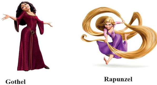
Figure 5.1 Characters from the Movie Tangled

of curiosity to fulfil her dream of experiencing the outside world.