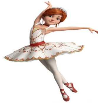
Figure 5.8 Character from the Movie Leap

She plays a significant mother-like role in honing Felicie’s ballet skills. She is mostly patient with the very headstrong Felicie. She proves to be a deeply committed friend and mentor to Felicie.