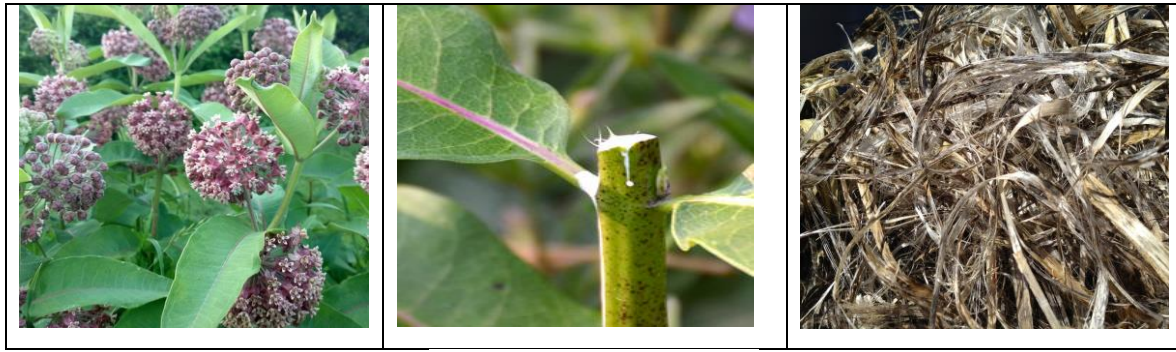
Fig: 1 Asclepias syriaca Fiber

Execution and removal of old-style textile materials are nowadays through more critically since it was gathering environmental recognition and the demands. Hemp, Flax, Sisal, Coir and Ramie are generally recycled for technical purposes. In modern times, the warning for renewable properties for fibers generally of plant origin is developing. Fibers like milkweed ( Fig: 1 ) floss, kapok is not positively spun into yarns and those fibers can be exploited in padding purpose. Stuffing can be done in pillow, mattresses, car seats it can be considered as home textile products and also in mobile tech.