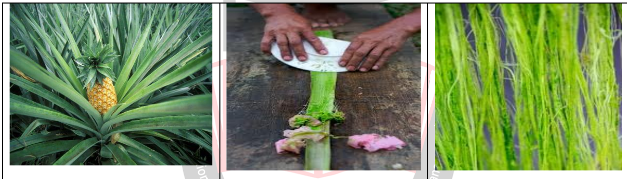
Fig: 2 Ananas comosus Fiber

The common name is Pineapple, the fiber is extracted from the leaf part can be converting as yarn and also which has proven for fabrication. Natural fibres composites are care-gripping to concern, for the purpose that of its thickness and environmental nature over out-dated compounds, Further than plant fibres, numerous animal fibres also have dissimilar types such as products originating the silk, feathers, animal fibres and aviaian fibre which are major source [3]