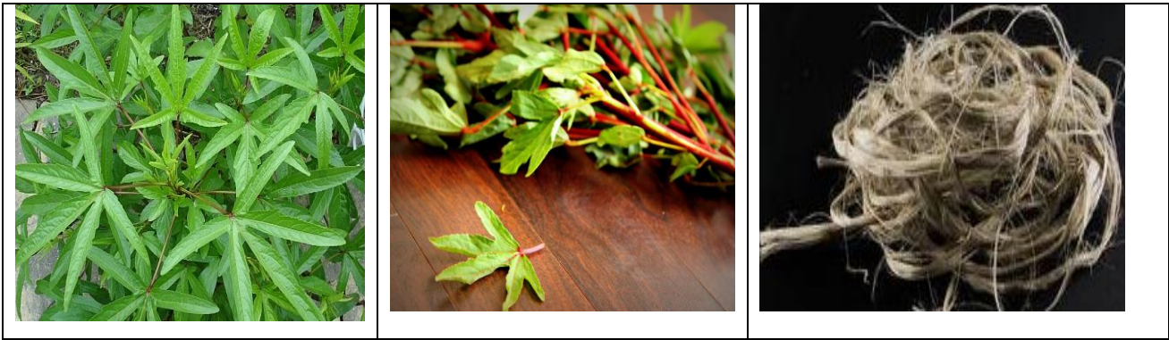
Fig:3 Hibiscus sabdariffa Fiber