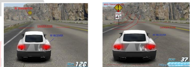
Over speeding Vehicle approaching Speed limit zone

Speed controlling is much older idea. It was used for many different purposes. Generally, speed of vehicle is controlled using brakes. In this case, the efficiency of vehicle gets reduced, as we work against the driving force provided by engine. In some cases, the speed is also varied by accelerator pedal. The varying pedal position is monitored using sensors and fed to a control unit known as Electronic Control Unit [3] . ECU determines the throttle valve position based on position of accelerator pedal. There are many sensors involved in such system. Also the inputs received from these sensors are used. The change in position of throttle valve causes speed change of vehicle.